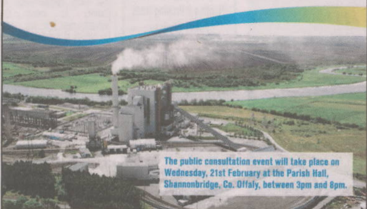
The public consultation event will take place on Wednesday, 21st February at the Parish Hall, Shannonbridge, Co. Offaly, between 3pm and 6pm.

Representatives from ESB and the wider project team will be present to provide information and answer queries on the proposed development.